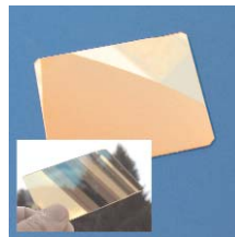
anti dazzle filter