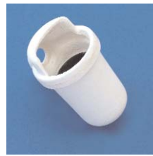
graphite crucible with fixed ceramic container