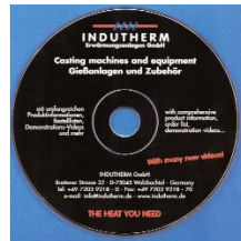
CD-Rom with Videos