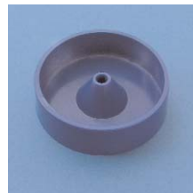
rubber base flask