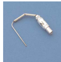
thermocouple inside molten material 1300° C