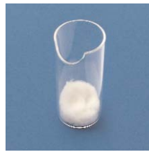
glas tube for inductor protection