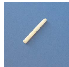
thermocouple ceramic cover in the material