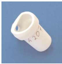
ceramic crucible for direct induction heating

For your information: The 4 digits numbers like C008 or C036 are not INDUTHERM order numbers. They are the drawing position numbers and shall help you to find this article in the assembly drawings and spare parts lists in your manual. INDUTHERM order numbers have 8 digits!