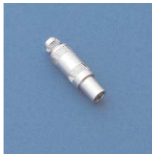
blind connector temperature measurement