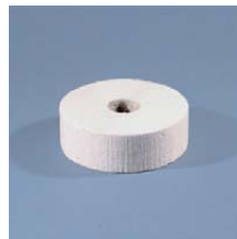
crucible bottom insulation