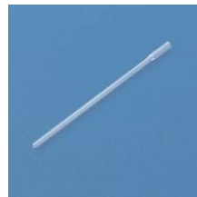
glas tube for thermocouple