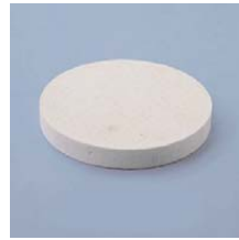
crucible cover fibre material