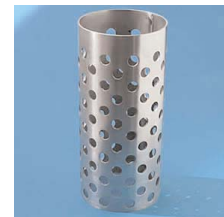
flask without flange and multihole