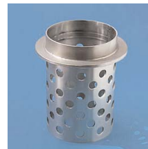
flask with flange and multihole