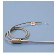
thermocouple bottom measurement up to 1200° green colour