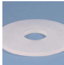
silicon gasket for flask without flange