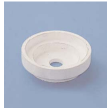
crucible cover ceramic