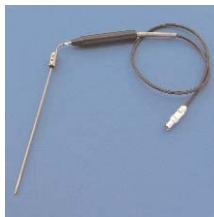
thermocouple inside molten material