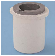
crucible MU400 with ceramic shell

For your information: The 4 digits numbers like C008 or C036 are not INDUTHERM order numbers. They are the drawing position numbers and shall help you to find this article in the assembly drawings and spare parts lists in your manual. INDUTHERM order numbers have 8 digits!