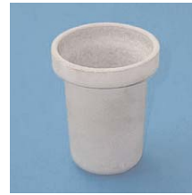
ceramic crucible MU200C