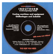
CD-Rom with Videos