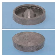
rubber sprue base